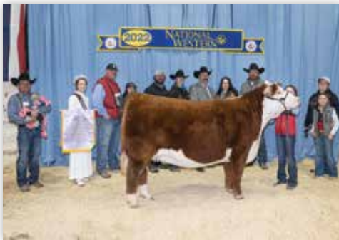
JCS ANNIE OAKLEY 0802 Dam of Lot 44