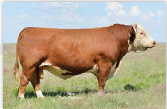
BR COPPER 124Y