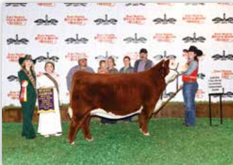
JCS 1107 MARY KATE 3588 Dam of Lot 54