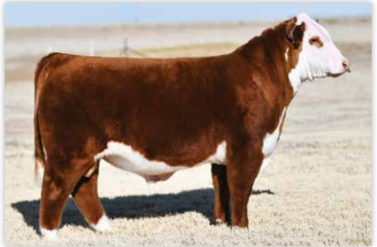
GREEN JCS MAKERS MARK 229G ET Sire of Lot 24