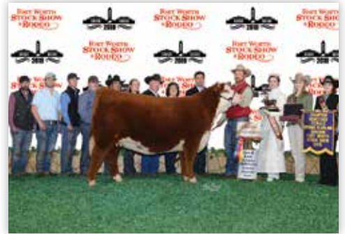
JCS MISS BUTTERCUP 7296 Dam of Lot 43