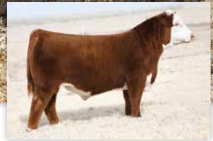
JCS EASTWOOD 4862 Full brother to Lots 1 & 2