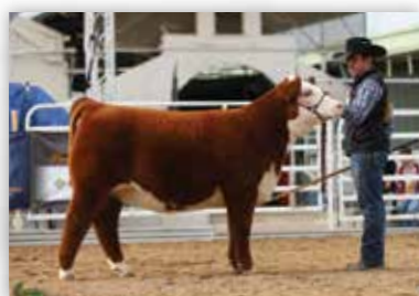
JCS VOODOO LADY 2442 ET Dam of Lot 10