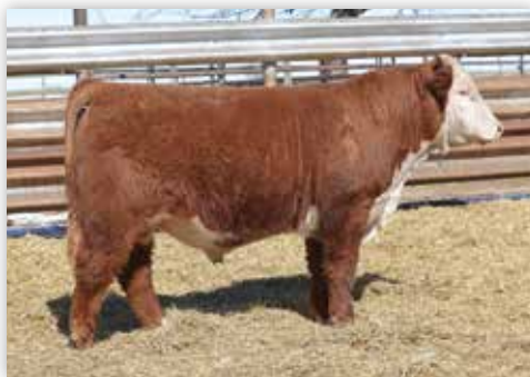
JCS 1321 MARK DOMINO 8341 Sire of Lot 40