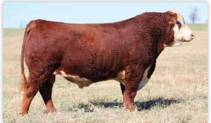
AW STATESMAN 038H