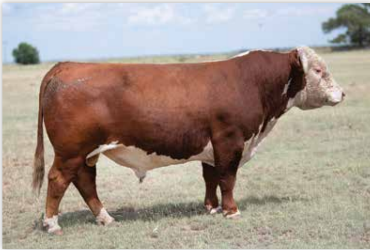
H5 906 DOMINO 1107 Sire of Lot 48