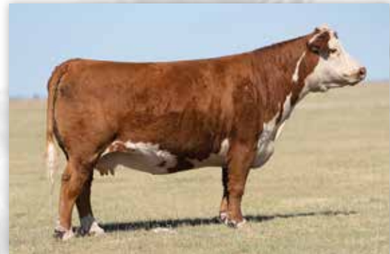
JCS MISS 240 SENSATION 4599