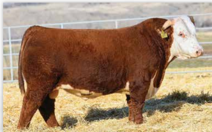
CHURCHILL STANFIELD 3122L