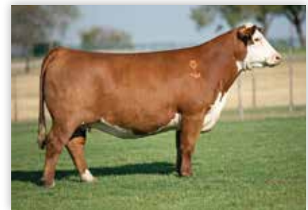
GKB 7210 BRIELLE J114 ET Dam of Lot 25